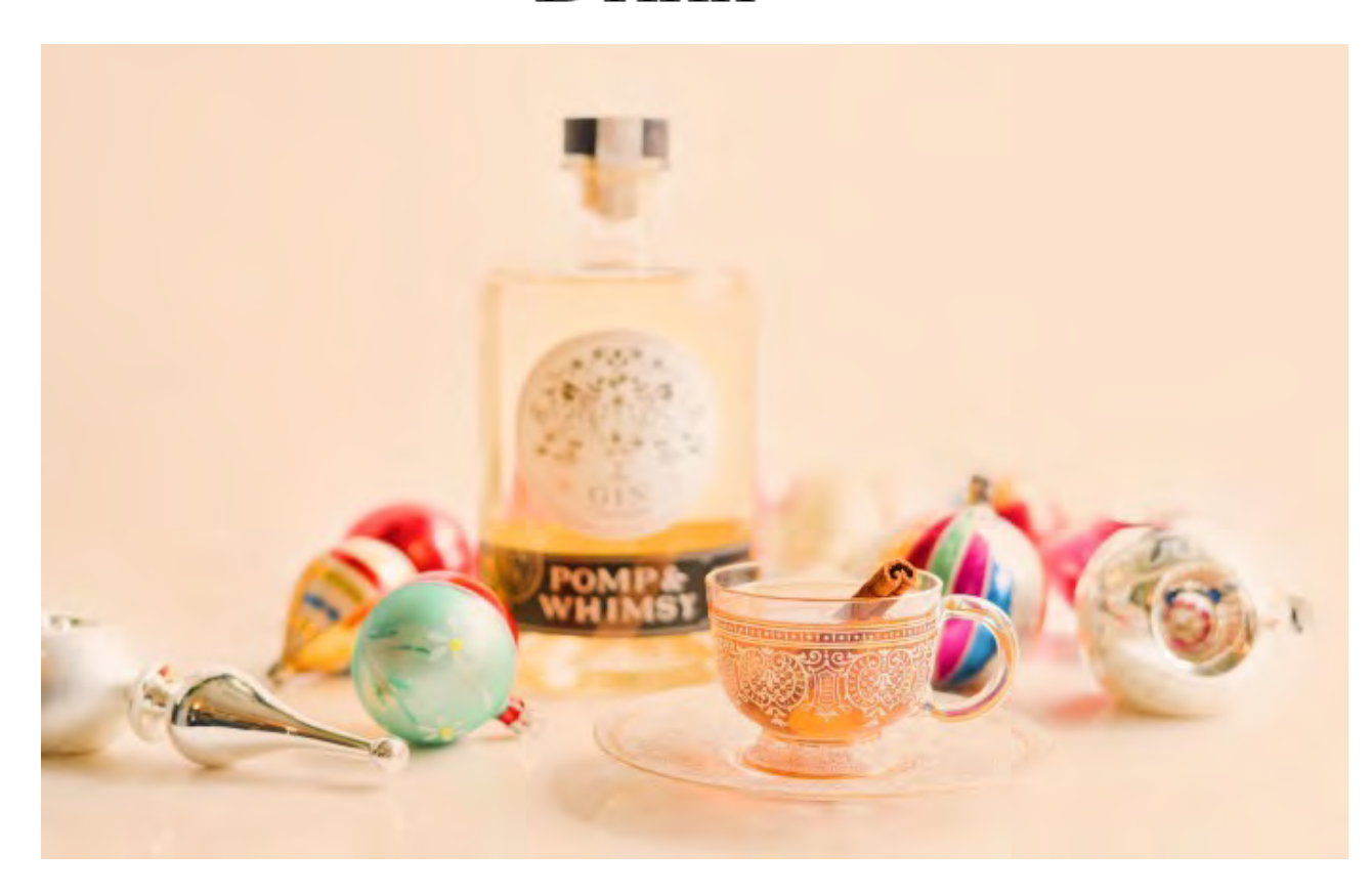
<u>Pomp & Whimsy</u> is an intriguingly floral gin cordial made with 16 botanicals including grapefruit, lychee, jasmine pearls, and coriander. It makes a radical base for cocktails or simply sipped by itself. Or left beside Santa's soon-to-be-abandoned cookies.